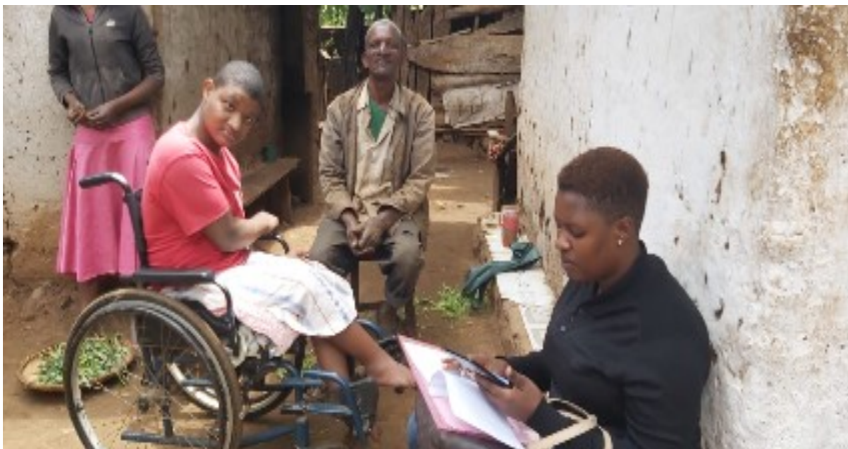
Picture__: Data verification for one of the beneficiaries living with disabilities.

high level of disability and confirmed as being eligible for disability benefit as summarized in Annex 1.