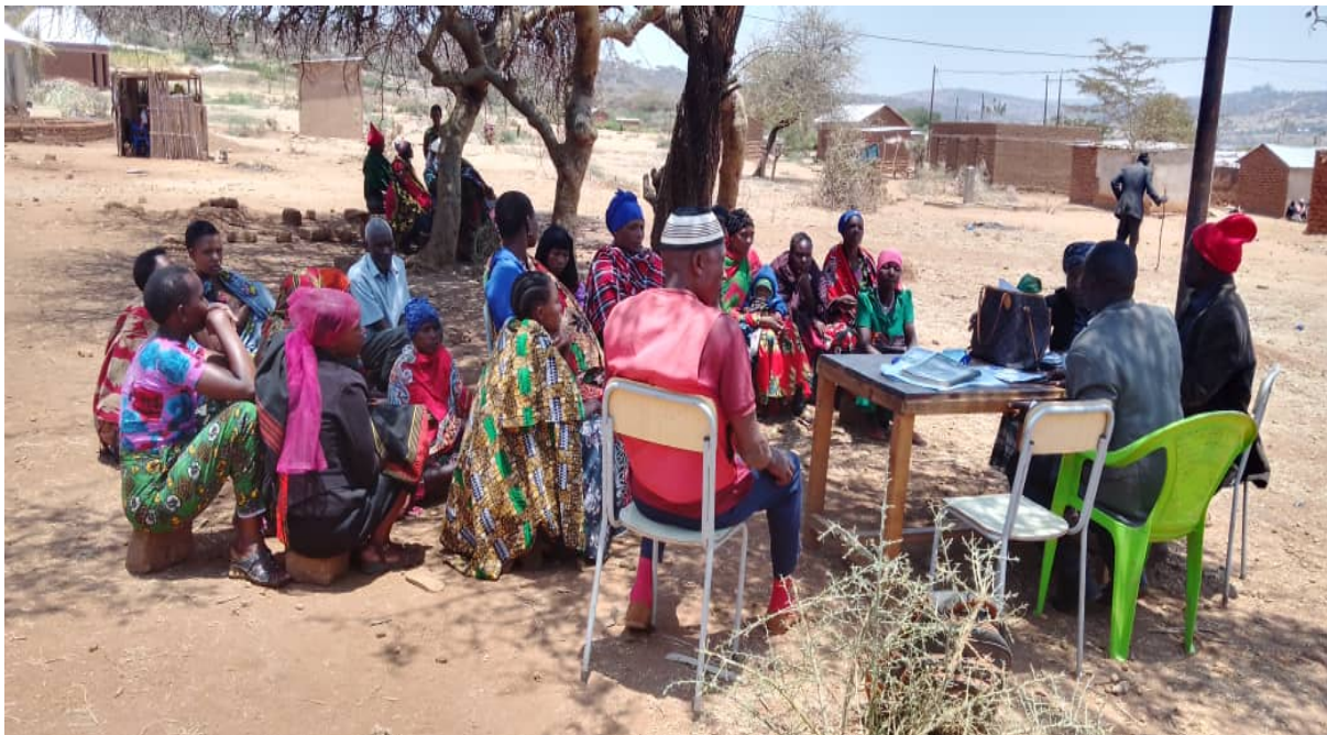
Picture__: Beneficiary saving group formed in Singida DC.